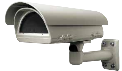
VERSO COMPACT + WB0VA2