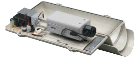
VERSO COMPACT + CAMERA