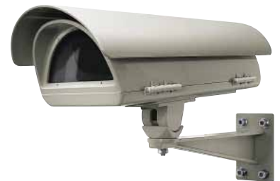
VERSO COMPACT + WBJA